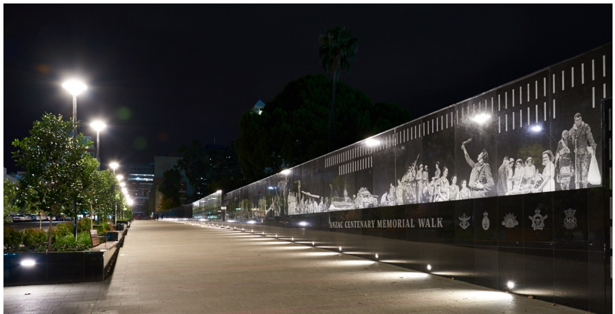
'A memorial for all, not a few.' The Anzac Centenary Memorial Walk, Kintore Ave, Adelaide.